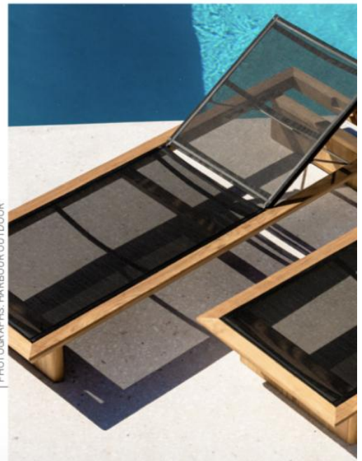
PHOTOGRAPHS: HARBOUR OUTDOOR